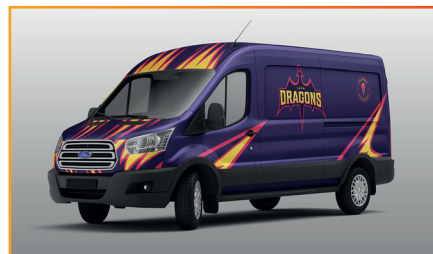
For Vehicle Wraps