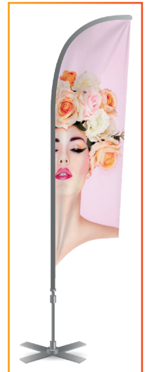
For Soft Signage