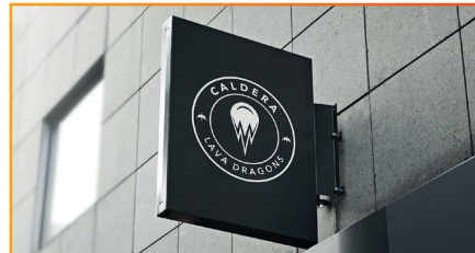
For Sign & Graphics